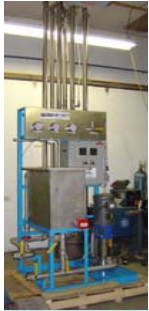
WWPro Series Recycler Ready for Shipment

Reductions in staff, from the office to the shop floor to your maintenance group essentially mandates keeping cleaning operations in use for longer periods than ever before. No time or personnel to dump and recharge your wash tanks... But you already know that recycling makes more sense today than at any prior point in our history; you own a Washer Washer! Even so, considering cutbacks in staff, increased cleanliness demands, more abundant and/or more difficult contaminants due to new sources for the parts or metals themselves, it is getting tougher to maintain parts' quality let alone keep an eye on your recycling system(s). Why not eliminate checking and recording your recycler's performance from the human resources equation?